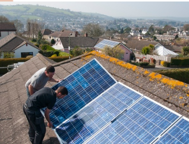
A new solar panel system is installed.

This scheme is now coming to the end with only a couple of properties awaiting completion of the installation. I have thoroughly enjoyed working with this group of clients, their passion and commitment to renewable energy has been amazing and I am proud to have been part of something so important to them."